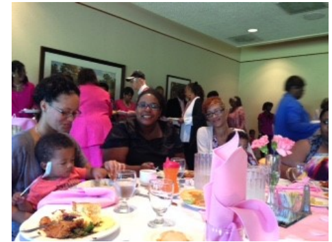
Participant and son enjoying a nice soul food lunch with board members at the Pretty in Pink Luncheon at the Park Hill Golf Course